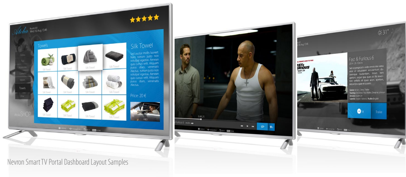
Nevron Smart TV Portal Dashboard Layout Samples

Nevron IPTV Platform is designed to cater for the needs of any kind of IPTV projects running on any kind of technology environment. All its SW components are developed in-house, from Encoders – Gateways, Transcoders, Middleware Backend to various kinds of Middleware Clients such as Smart TV Portal and STB Android as well as Linux Portal, Tablets or Mobiles.